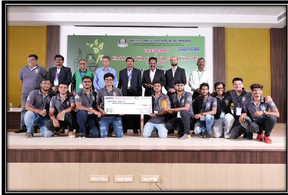
FINAL YEAR STUDENTS RECEIVING THE PRIZE IN THE SAEISS ELECTRIC TWO WHEELER COMPETITION -2019