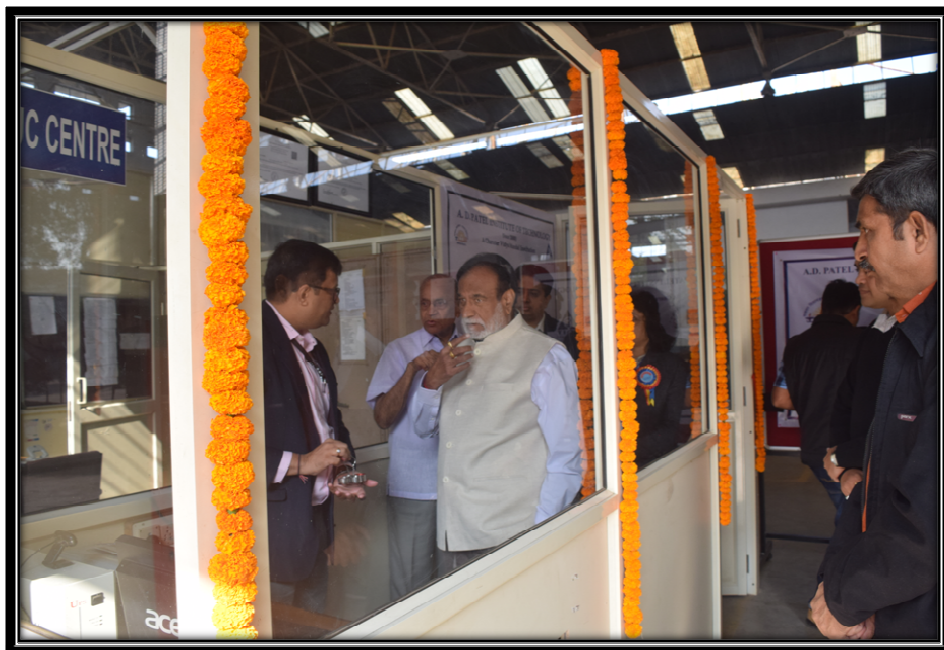
THE HON. CHAIRMAN CVM AT PUC CENTRE FACILITY IN ADIT