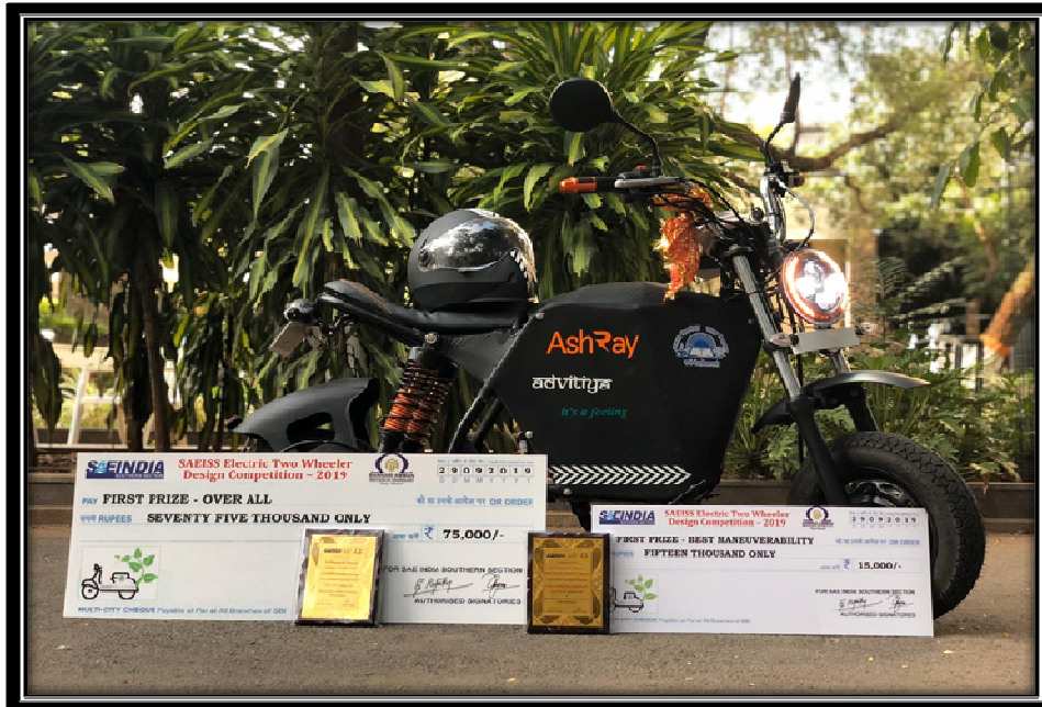
THE PRIZE IN OVERALL AND BEST MANEUVERABILITY AT ELECTRIC TWO WHEELER DESIGN COMPETITION -2019

Final year Automobile engineering students had been participated in national level competition “Electric Two Wheeler Design Competition” organized by SAE Southern section, at Satyamangalam, Erode, Tamilnadu in September 2019. They made electric two wheeler which had cost them 75000/- rupees and they claimed that it gives 72 Km average per one recharge. This two wheeler takes approx 3 to 4 hour to complete recharge normally.