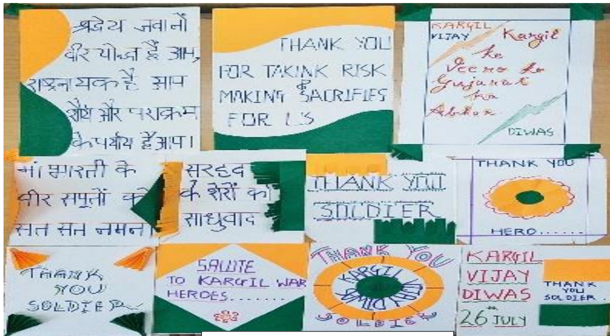
Cards for Kargil War Heroes 07/09/21