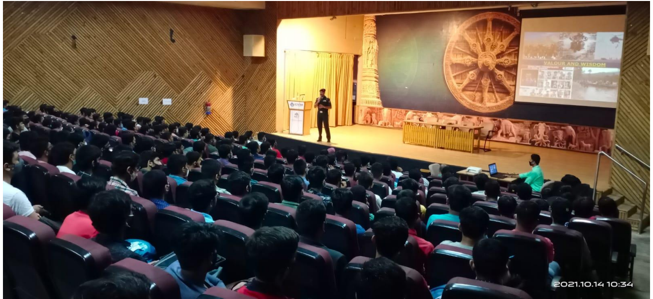
NCC Orientation 14/10/2021