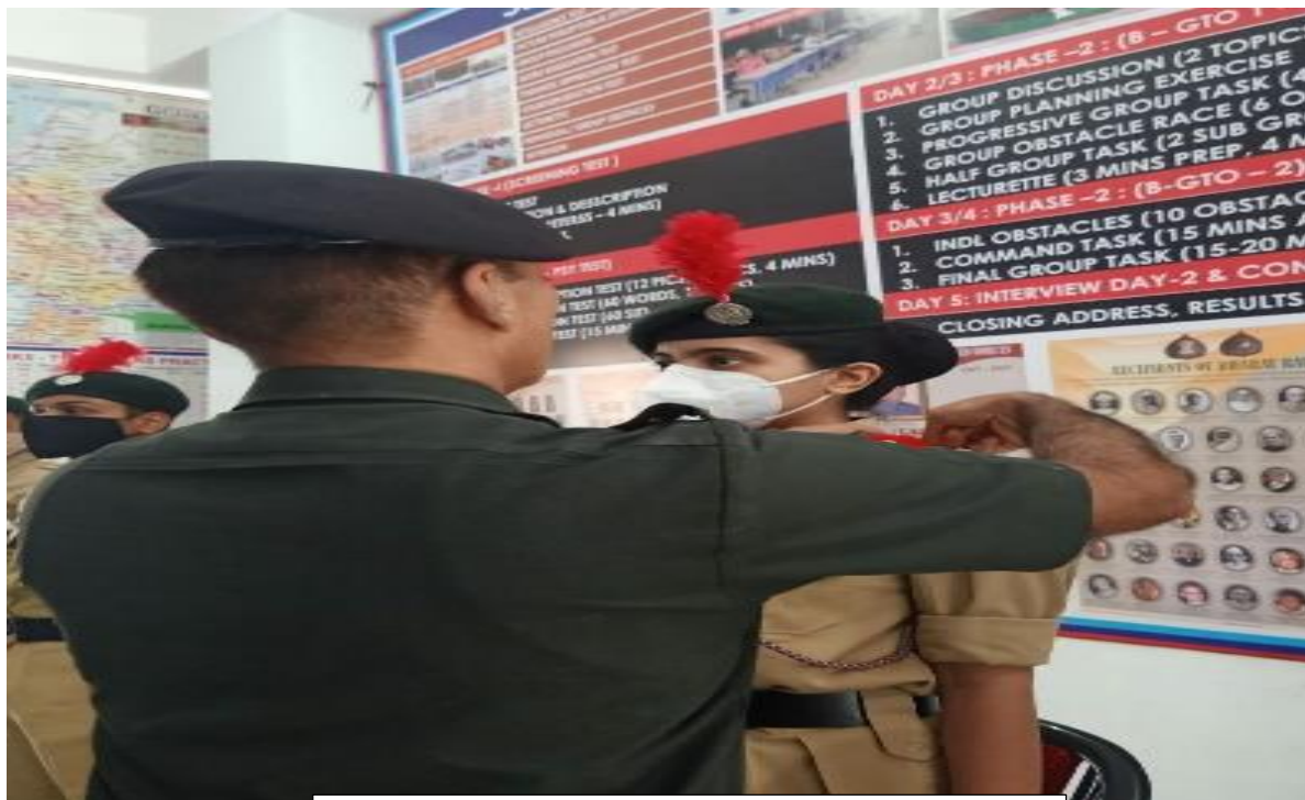
Promoted rank of UO and sergeant 22/07/21