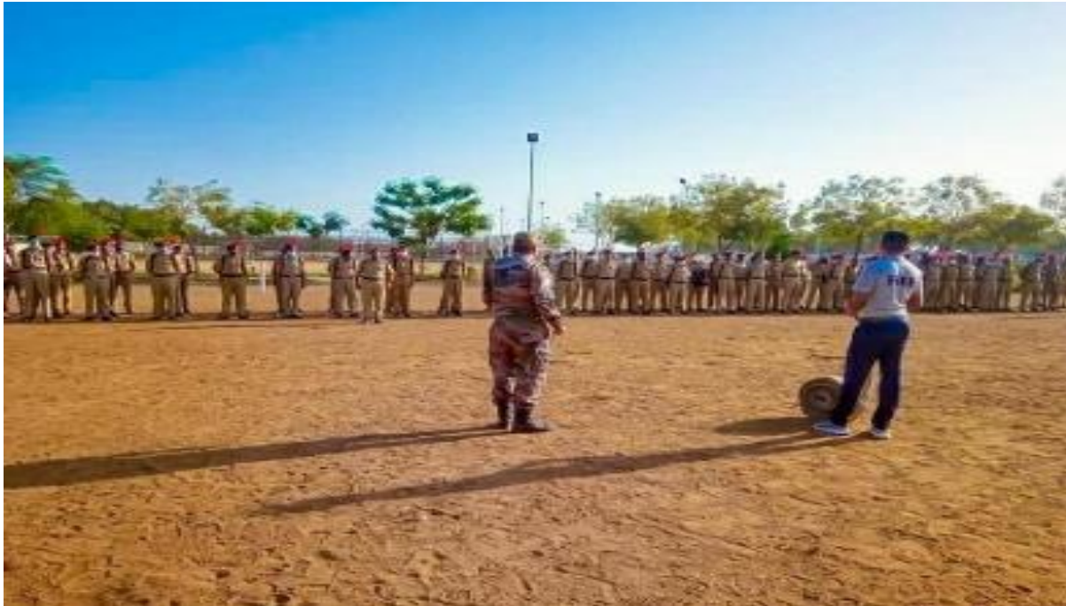
Annual Training Camp 3-9 October 2021, 18-24 October 2021