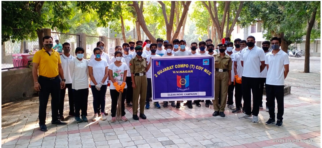
Clean India Program 28/10/2021